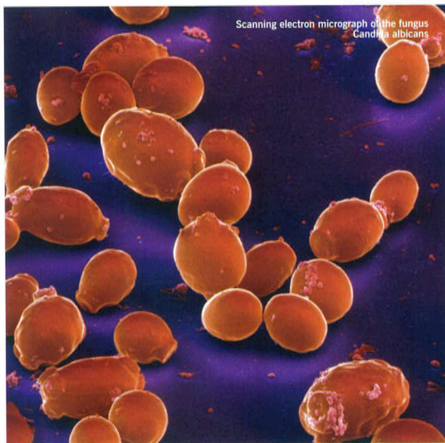
Scanning electron micrograph of the fungus Candida albicans

The best selling thrush product on the market is Canestan Duo (Bayer Consumer) which combines a capsule to clear the internal infection and a double strength cream to soothe itching. According to IRI market research data for the 52 weeks commencing February 24, the market is currently worth £40m at retail prices. Canestan Duo is currently on TV on all major national terrestrial and satellite channels until August 12 in a campaign to encourage women who want a hassle-free and effective treatment to trade up to a combination product. Canesten Duo's brand manager comments: "We feel confident that this broadcast support behind Canestan Duo will help to drive women in store for pharmacists' advice and recommendation on combination